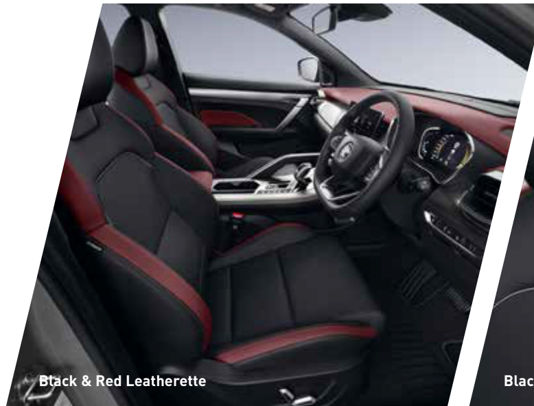
Black & Red Leatherette