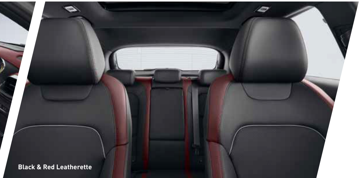
Black & Red Leatherette