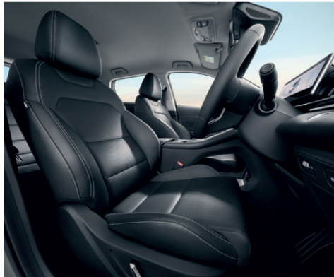
1.5TD Premium Black Leatherette Seats